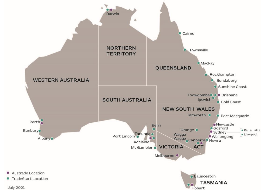
Austrade's national network